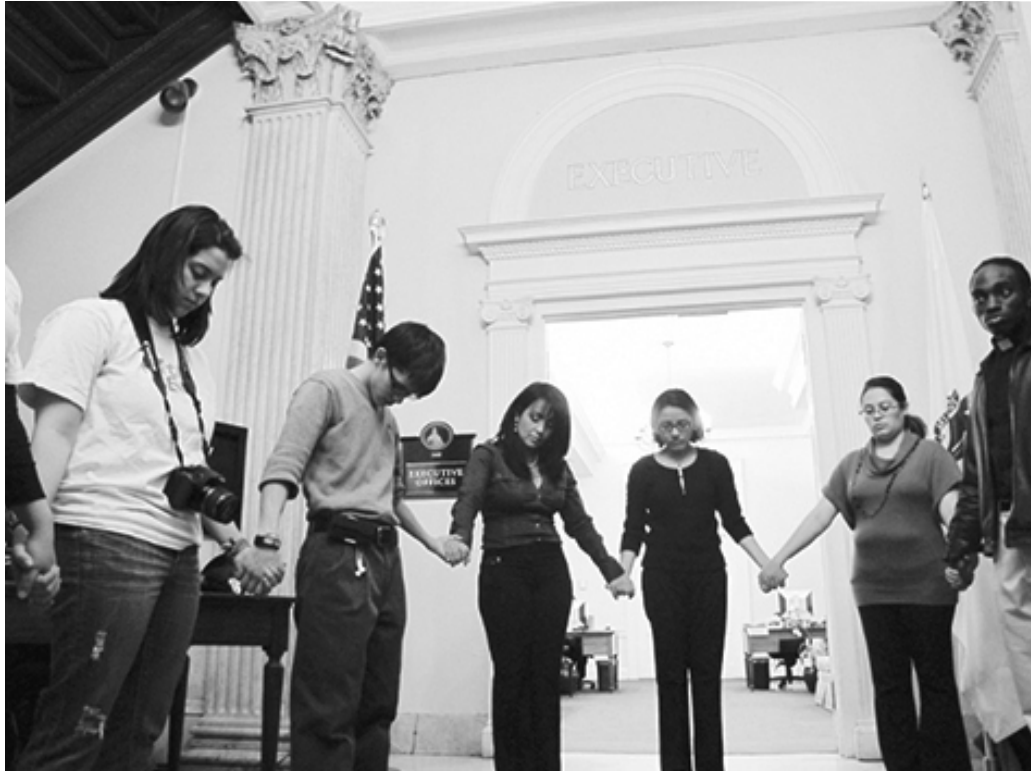
Local advocates at Massachusetts State House

Latinos are broadly sympathetic toward LGBTQ rights, with 83 percent supporting housing and employment non-discrimination protections for gay people.