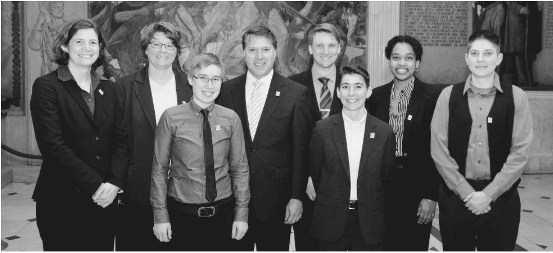
MassEquality staff at the signing of the Transgender Equal Rights Bill in 2011

on Nov. 23, Gov. Deval L. Patrick signed it into law, making Massachusetts the 16th state in the nation to treat transgender citizens as a protected class. 24 The five-year battle to extend nearly all available legal protections to the transgender people of Massachusetts had finally come to an end.